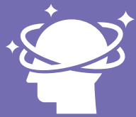
anxiety and stress

The Health App Finder is safe, secure, free and features hundreds of recommended apps to help stay healthy and well and manage specific conditions including: